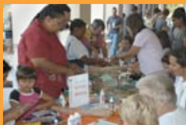
Visitors enjoyed many art making activities at the Blanton on Austin Museum Day 2007.