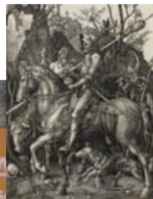
Albrecht Dürer Knight, Death, and the Devil , 1513