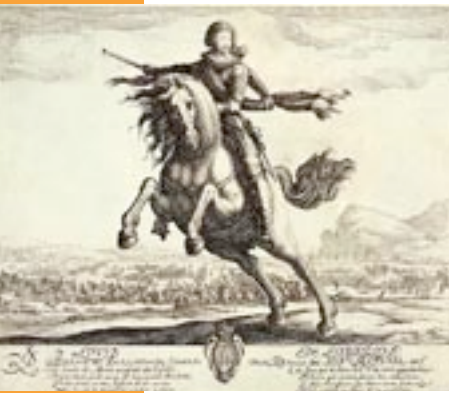
Jacques Callot, The Prince of Phalsbourg , 1623 Etching, The Leo Steinberg Collection, 2002